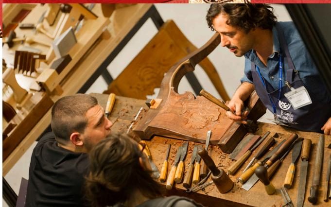
Foundation Ricardo Do Espírito Santo Silva