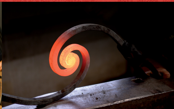
Perrault Frères Workshops