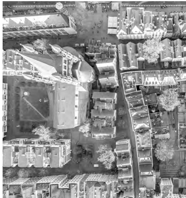
Kölner Dom Luftbild CC BY 2.0