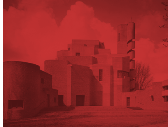
Christi Auferstehung Church in Cologne Lindenthal