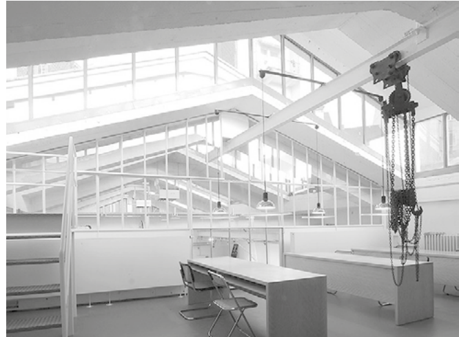
Exhibition rooms, library and workplaces in the Forum of the Stiftung für Kunst und Baukultur Britta und Ulrich Findeisen (Foundation for Art and Building Culture Britta and Ulrich Findeisen)