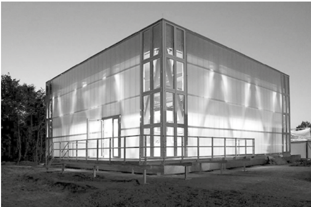
The Cubity studio building